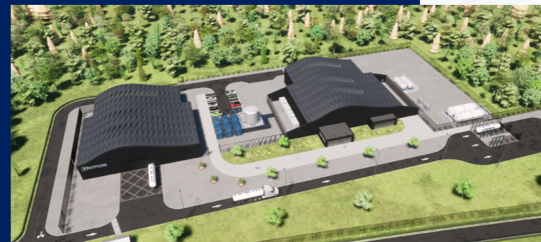
Indicative image of what the HPF could look like